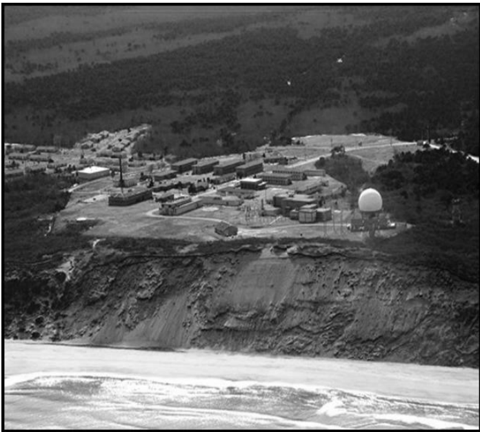
Aerial view of the entire site.