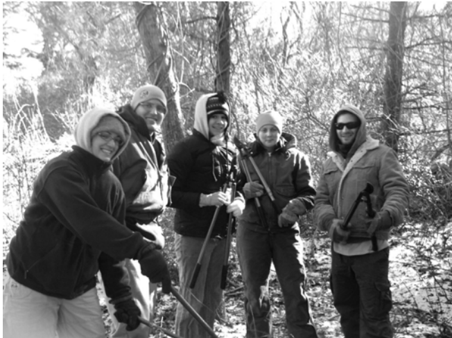
AmeriCorps members work to clear out invasives at Meetinghouse Farm.