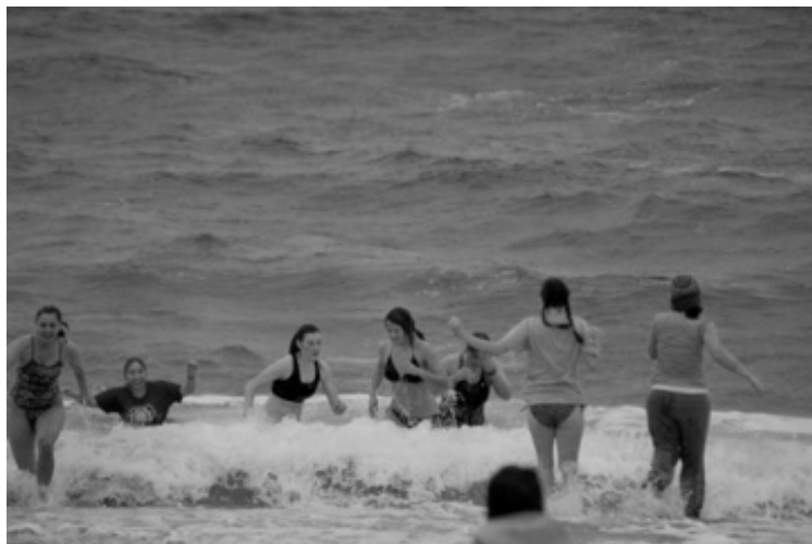
The plungers run back to the shore with frozen feet.

During these weeks, I often contemplated: do I have it in me? In spite of my Western New York blood, the mere thought of a Winter Solstice swim made my fingers and toes ache, imagining potential frostbite.