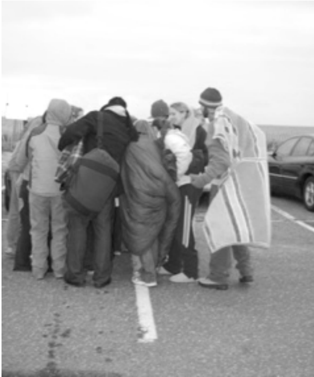
Wellfleetians and Bournians huddle before the plunge.

As more members of both the Bourne and Wellfleet houses pulled up and gathered around waiting for the inevitable, a certain air of anticipation could be felt; a mixture of both excitement and fear. I walked over to where a crowd of committed plungers were gathered, almost ceremoniously attempting to pump each other up for the coming event with mini pep talks and encouraging hugs. The non-plungers created a semi-circle around the rest of us, some taking pictures, and all wearing looks of “glad it’s not me.”