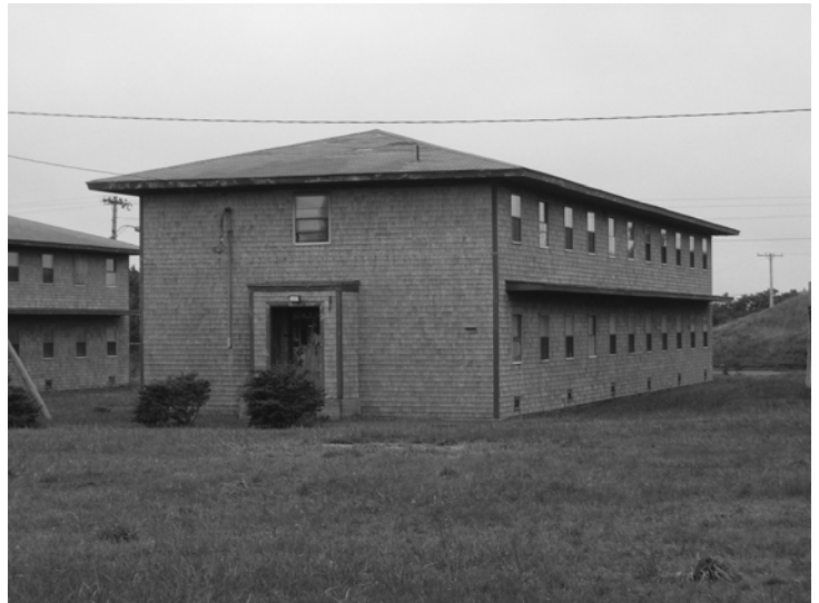
Pictured above is Building 11, which AmeriCorps has leased.