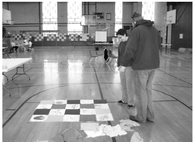
A finished quilt top waits to have its back layer attached.