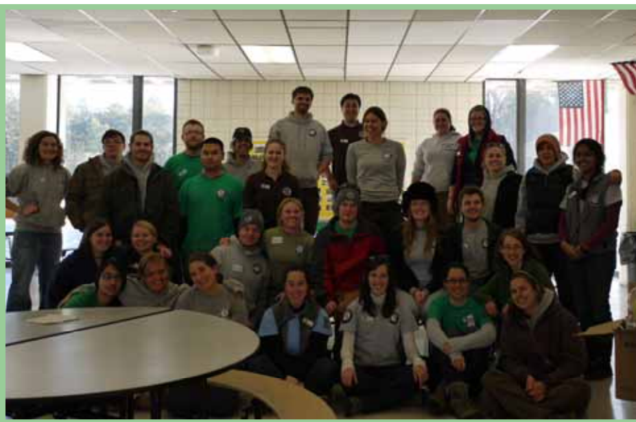
Members and staff celebrate Martin Luther King Jr. Day of Service!

Volunteers and staff wrapped up the day with a community lunch, thanks to the Olive Garden, back at headquarters (Mattacheese Middle School). It was truly a productive day and a rewarding experience to serve with other volunteers!