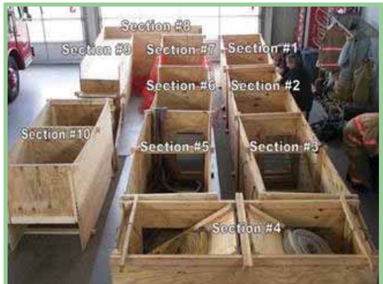
The SCBA Maze sections at the West Barnstable Fire Department.

As my Individual Placement is with the Wbfd, I am always excited to tell anyone who works with the maze that AmeriCorps Cape Cod was part of its construction. The Maze was completed and used for multiple trainings with the firefighters, the Junior Fire Department, and even as a fun Halloween maze for our Community Halloween Fun Day Event.