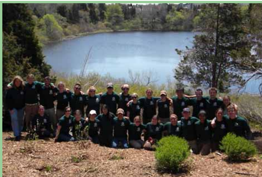
Members and staff celebrate a successful AmeriCorps Week at Uncle Harvey's Town Landing!