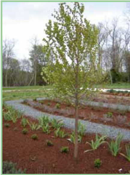
725 Main Street Phytoremediation Nursery

In 2001, the Town of Barnstable utilized Land Bank Open Space funds to acquire the former Gulf station located at 725 Main Street, Hyannis. The purpose of the acquisition was to cultivate a community space to serve as a mitigation nursery while using phytoremediation methods to remove toxins below grade. Overall, the Town hoped to generate a positive environmental impact and create sustainable land management. The perennials chosen for this site are unique in that their root systems pull pollutants from the ground as they grow. Such plants include Russian Sage, Liriope, Blue Lyme Grass, Lamb's Ear, Dogwood Trees, Day Lilies, Gay Feather, Cat Mint, and Black-Eyed Susans. Brownfield sites and other properties within the Town benefit from the 725 Phytoremediation Nursery as the plants grown there have been, and will continue to be, split and transplanted to other locations within the Town to assist in pollution control.