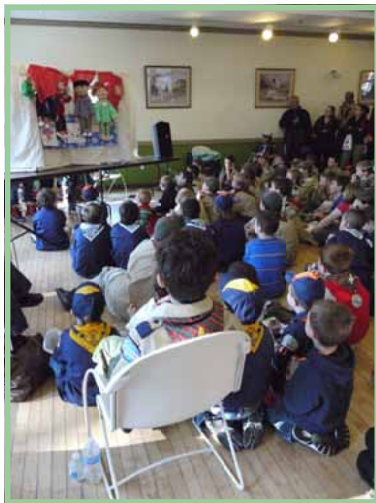
Boy Scouts watch an emergency preparedness puppet show.

Earlier in the year, The Cape Cod and Islands Chapter of the Red Cross