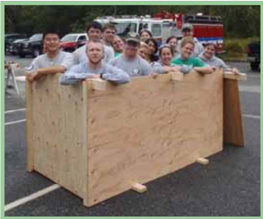
The Bourne House shows off a completed section of the maze at their carpentry training.

I continued my placement with the West Barnstable Fire Department for my second term with AmeriCorps Cape Cod. I was excited to learn that we would be having our construction training at the West Barnstable Fire Department constructing a Self-Contained Breathing Apparatus (SCBA) Maze. The purpose of the maze is to provide training for the Fire Department.