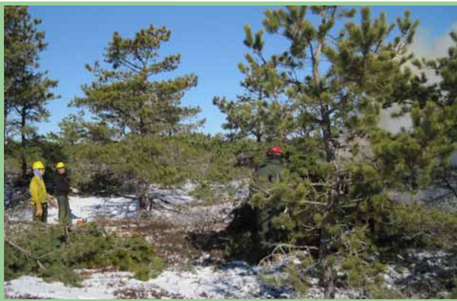
Members and fire crew staff keep an eye on a burn pile at the Marconi Heathlands.

Many Cape residents see evidence of the National Seashore Wildland Fire Crew: teams of people working with chainsaws, large fields and forest floors scorched black by controlled fires, smoke rising into the air, bright orange signs along the road. If anybody outside looks even briefly, they can see the fire crew or their work. If they looked closer however, they would see something that most people don't notice: the amount of volunteers working with the crew. While the five-man, National Seashore employed fire management crew does the majority of the work in the area, a sizeable chunk of the work done in the National Parks is done by volunteers working alongside the fire crew.