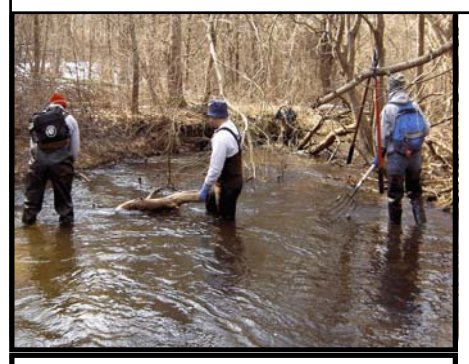
• Herring run clearing in Harwich and elsewhere

Mashpee: • Trustees of Reservations land maintenance