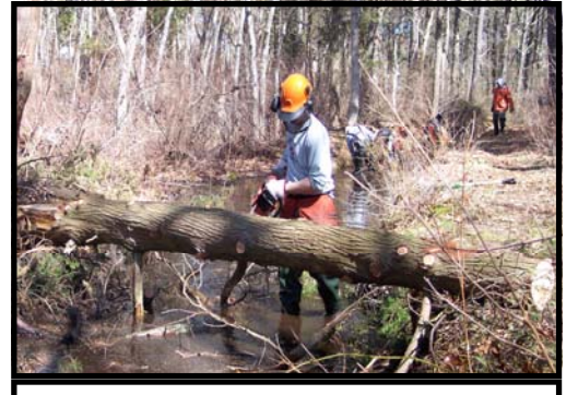
Herring run clearing in Yarmouth