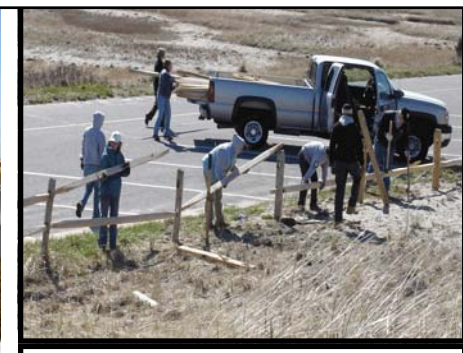
• Repairing fencing around beaches in Eastham