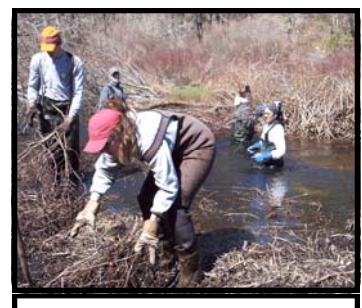
Quashnett River restoration in Mashpee/Falmouth