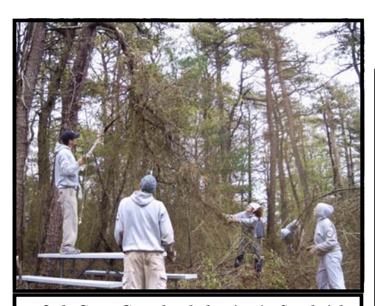
Oak Crest Cove land clearing in Sandwich

Members made several visits to Sandy Neck Beach in Barnstable to do much habitat protection, including installing symbolic