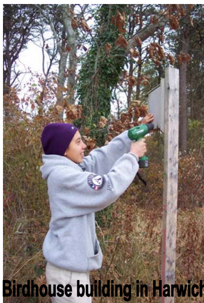
Birdhouse building in Harwich