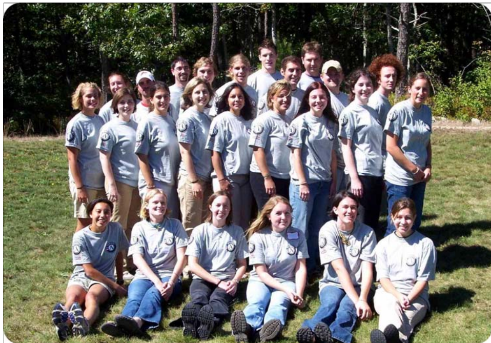
INTRODUCING YEAR SIX, FRESH OUT OF THE BOX, NEW MEMBER SMELL, READY TO GET THINGS DONE.

-Feel free to throw all invasive species, inclement weather, poison ivy, sarcasm, rabid dogs, voice mail, and dial-up internet connections out the window.