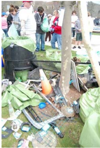
(Picture on the left) Volunteers and Americorps members successfully begin their collection of trash and recyclables from the Cape Cod Canal.