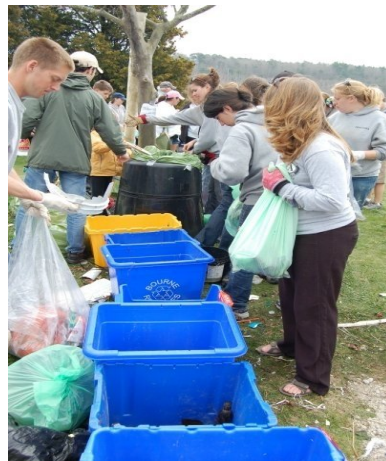
Canal Cleanup collected 774lbs of trash, 1/2 will be sold as recyclables for the town!