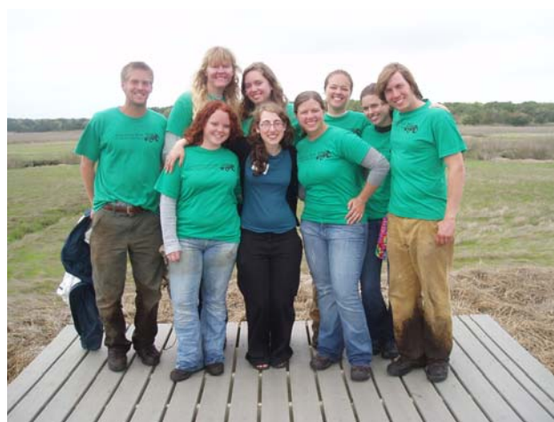
The Year 10 members and staff responsible for coordinating a successful AmeriCorps week enjoy the finished boardwalk.