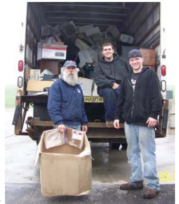
E-waste collectors with a truck full of electronics

Electronic waste (or e-waste) has become an increasing issue due to escalating production and use of technology such as computers, MP3 players, and TVs. Inadequate electronics disposal methods cause toxin release into the environment and lead to illegal shipment of hazardous electronics to developing countries. Despite ongoing efforts of organizations and law-makers to ethically and responsibly recycle electronics, many companies continue to ship their collected electronics to U.S. landfills.