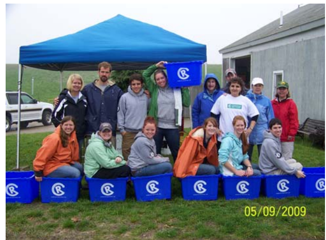
AmeriCorps members and the Chatham Recycles group show off some recycling bins.

The Basal Action Network works towards e-waste recycling accountability—visit their website at http://www.ban.org/ to view lists of recyclers who uphold principles of social and environmental justice when dealing with e-waste.