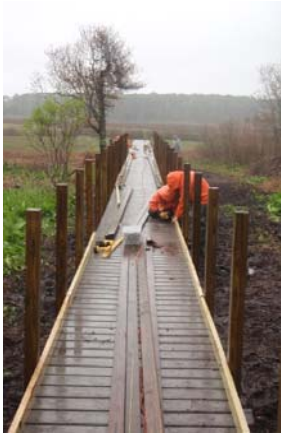
After several rainy and muddy days, the Taylor-Bray Farm boardwalk awaits some final touches.