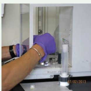
Samples, such as wood or peat, are weighed into individual reactors (above) for pretreatment in an automated reaction system (left). Pretreatment removes extraneous carbon, such as

carbonate and soluble humic material, and ensures that the carbon being dated is from the selected macrofossil.