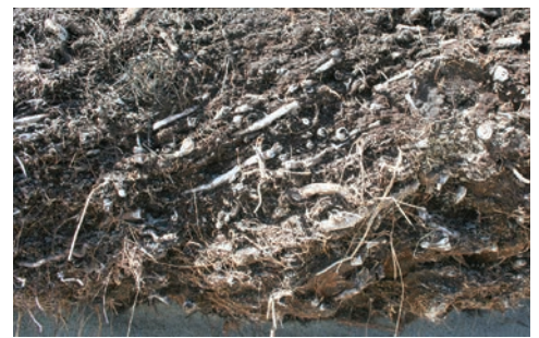
A close-up of a peat deposit showing the roots, sticks, and twigs that are intertwined throughout the peat matrix.