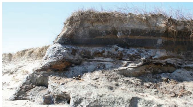
An example of a recently exposed outcrops. The color and sediment type (sand/mud/clay) changes indicate different depositional environments.

The stratigraphic record (aka the layer cake of different types of soil, that you would encounter by digging a hole, with each layer correlating to a distinct ancient environment) of Cape Cod changes dramatically depending on the exact area in which you are looking at it. In general, there are layers of till and outwash deposits characterized by a mix of sand, gravel, and large boulders, and/or glacial lacustrine clay (ancient lake deposits) form the basement of many coastal landforms on Cape Cod. These earlier deposits have been reworked by waves and wind and often capped by salt marsh peats and sandy beach/dune material. During the regression when sea levels were about 400 feet (130 meters) below present levels, forest soils and freshwater marshes, were deposited over the ancient lake clays. As sea level began to rise, large areas of Cape Cod's ancient landscapes were removed from the geologic record by erosion and reworking of sediment. The record left by a migrating beach illustrates the transition between fresh and saltwater systems. In this case, areas once containing coastal forests transitioned to salt marsh or beach environments. Evidence of these former landscapes can be seen in the recently exposed outcrops on Cape Cod beaches.