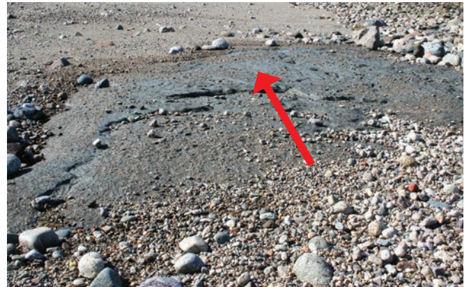
An example of clay exposed at the surface of a beach.