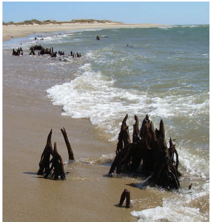
Erosion along a 200-meter section of South Cape Beach State Park (Mashpee) revealed the presence of 111 preserved stumps in growth position in intertidal and subtidal areas within an intermittent peat deposit.