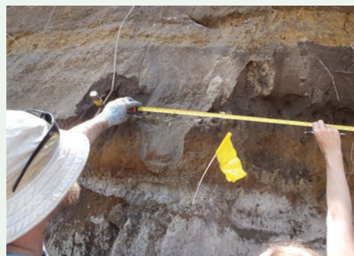
A team of Coastal geologists and radioisotope scientists work together to stratigraphically map the outcropping remnants of ancient landscapes at Coast Guard Beach. They collected dozens of organic samples for radiocarbon dating. The research will help to decipher the evolution of the Cape Cod shoreline during the past 10,000 years.

tion in the waters surrounding Cape Cod has included drowned forests, peat deposits and artifacts dredged by fisherman. When these cultural resources are found with preserved environments they provide valuable context to current and future change.