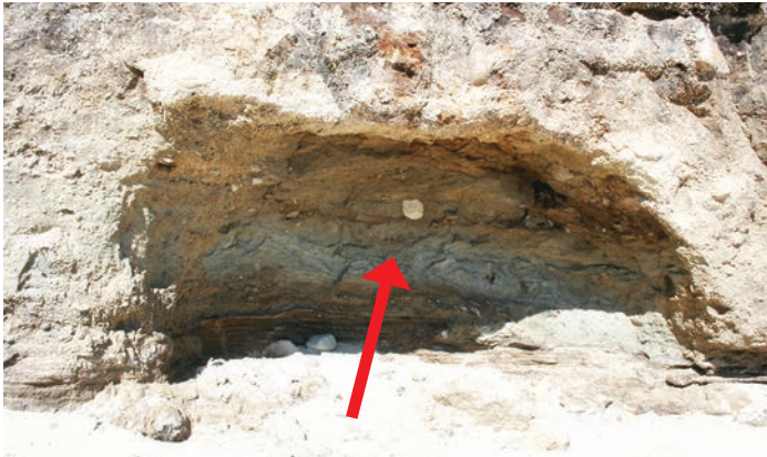
An example of clay exposed, as one of the layers comprising the coastal bank.

Clay that was deposited by glacial activity, often within large lakes formed by meltwater, can often be found under the peat. These stratigraphic layers are periodically exposed during storms and then are reburied as the beach and dune systems are reshaped by wind and waves. In southeastern Massachusetts, the materials deposited at the terminal end of the glacier, impounded large bodies of fresh water during the initial glacial melting period. This turned the landscape of what is now Cape Cod Bay into a glacial lake; the blue clay relates to deposits formed in this fresh water environment.