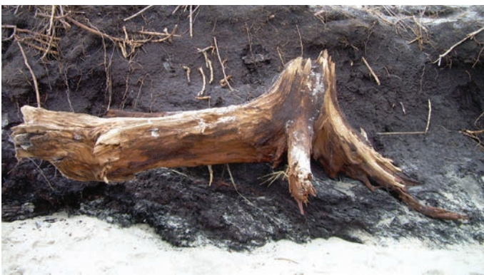
A stump sticking out of a layer of peat at Coast Guard Beach in Eastham. Based on two samples from within the vicinity of the stump it is likely more than 8,000 years old.