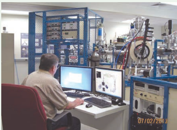
One of NOSAMS' two accelerator mass spectrometers. In these instruments, the atoms of ^{14}\text{C} in a sample are counted and compared to those in a standard. This information can be used to determine the age of samples younger than about 50,000 years.