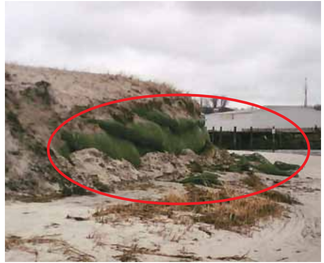
Two examples of geotextiles becoming exposed after erosion, reducing the effectiveness of the shoreline stabilization attempt.

filtration, such as revetment construction over soft soil. Non-woven geotextiles look like felt and can be used for erosion control. These materials are advertised as being “inert to biological degradation and resistant to naturally encountered chemicals, alkalis, and acids.” While these materials are never intended to see the light of day, they are not designed to break down quickly, rarely are suitable habitats if exposed, and eventually may be exposed if the BEC has exceeded its lifespan and shoreline retreat continues. If a BEC is required for a project, then a biodegradable fiber erosion control mat (available in a wide variety of weights, thicknesses, and mesh sizes) might be more appropriate than a material that will not degrade over time.